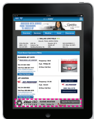
iPad App Lower Leaderboard Banner