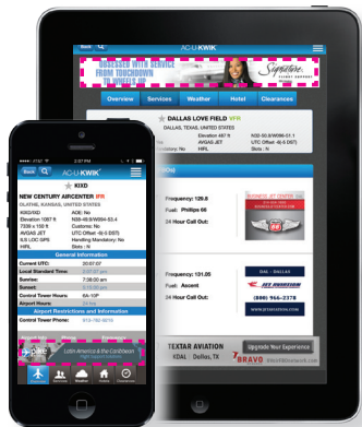
iPad Upper Leaderboard + iPhone Leaderboard Banner

Shared in a rotation with five max advertisers $17,520, 12 months